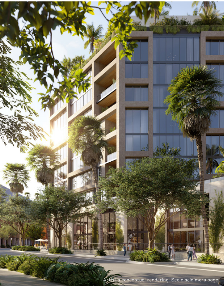
Artistic conceptual rendering. See disclaimers page.