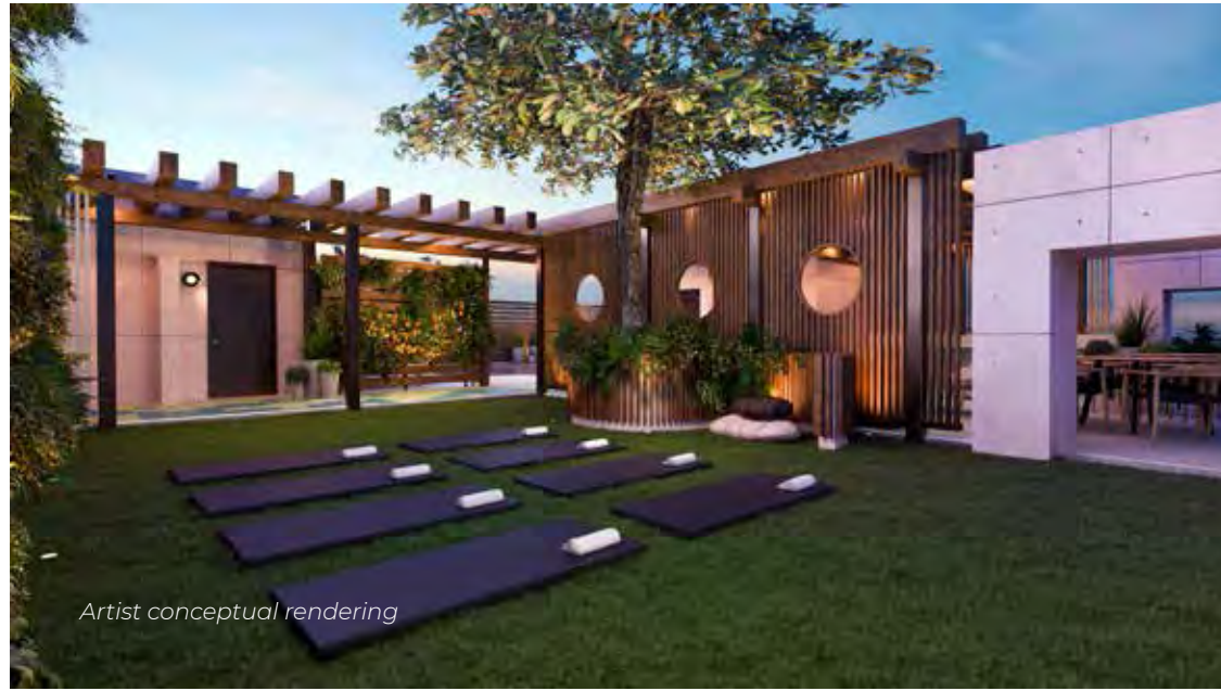
Artist conceptual rendering