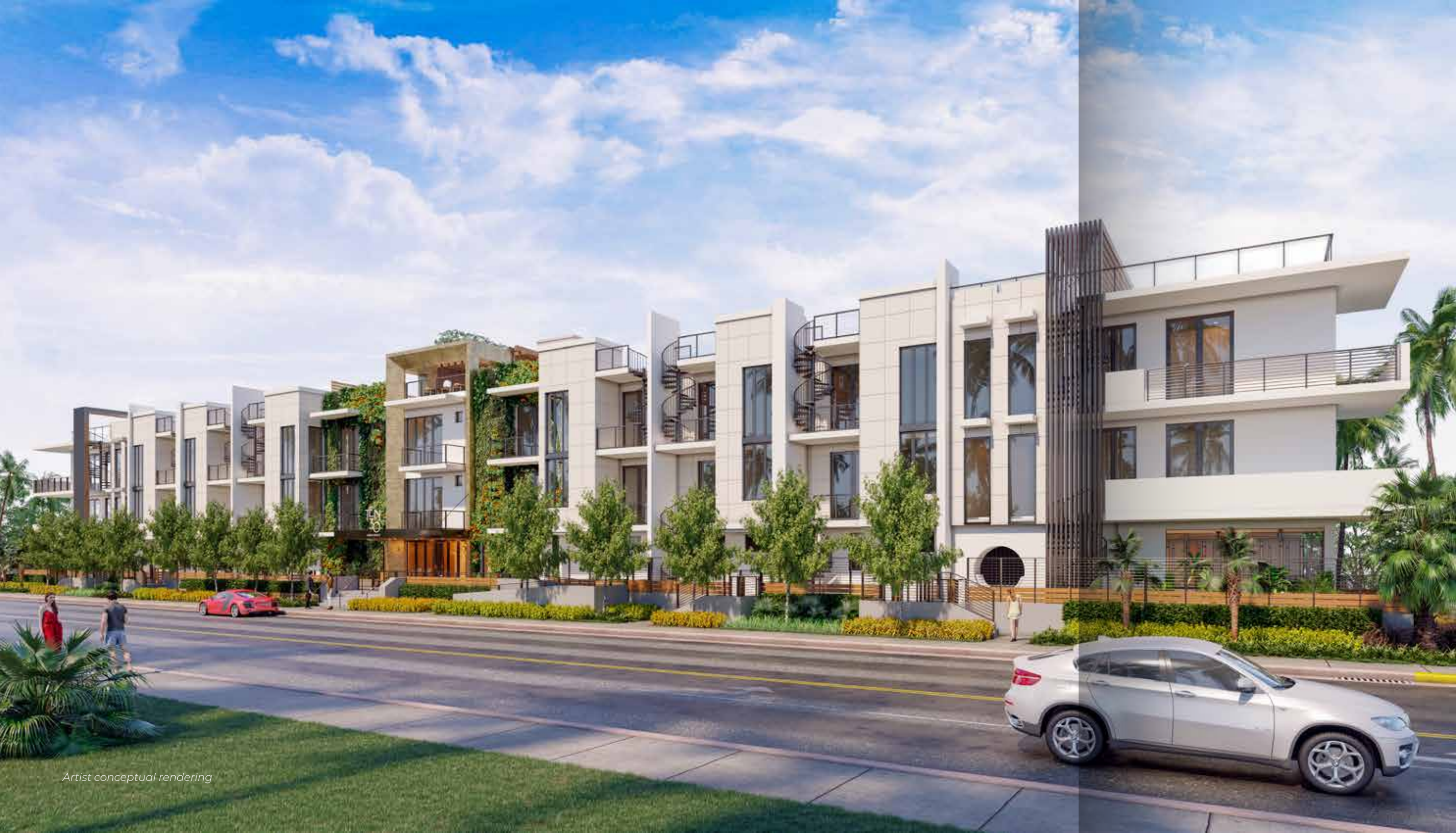
Artist conceptual rendering