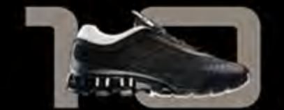
P'5510 Bounce:S 2 With suspension system of metallic springs