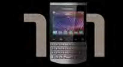
P'9981 Smartphone Porsche Design Smartphone from BlackBerry®