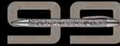
P'3110 Tec Flex Ballpoint Pen Stainless steel weave, borrowed from racing