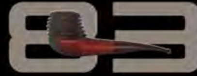
Pipe With machine-milled ribs for thermal cooling effect