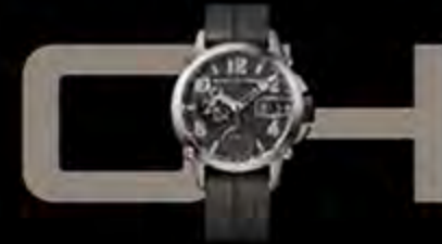
P'6910 Indicator Only chronograph with mechanical digital stopwatch function