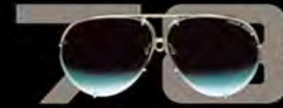
Pilot Glasses First glasses with lens-changing feature