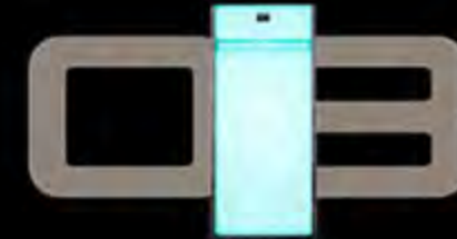
P'3210 Fragrance First fragrance from Porsche Design