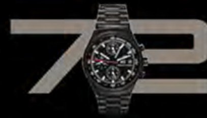
Chronograph I First all-black chronograph

The results are timeless products that have always been ahead of their time – and will continue to be so in the future.