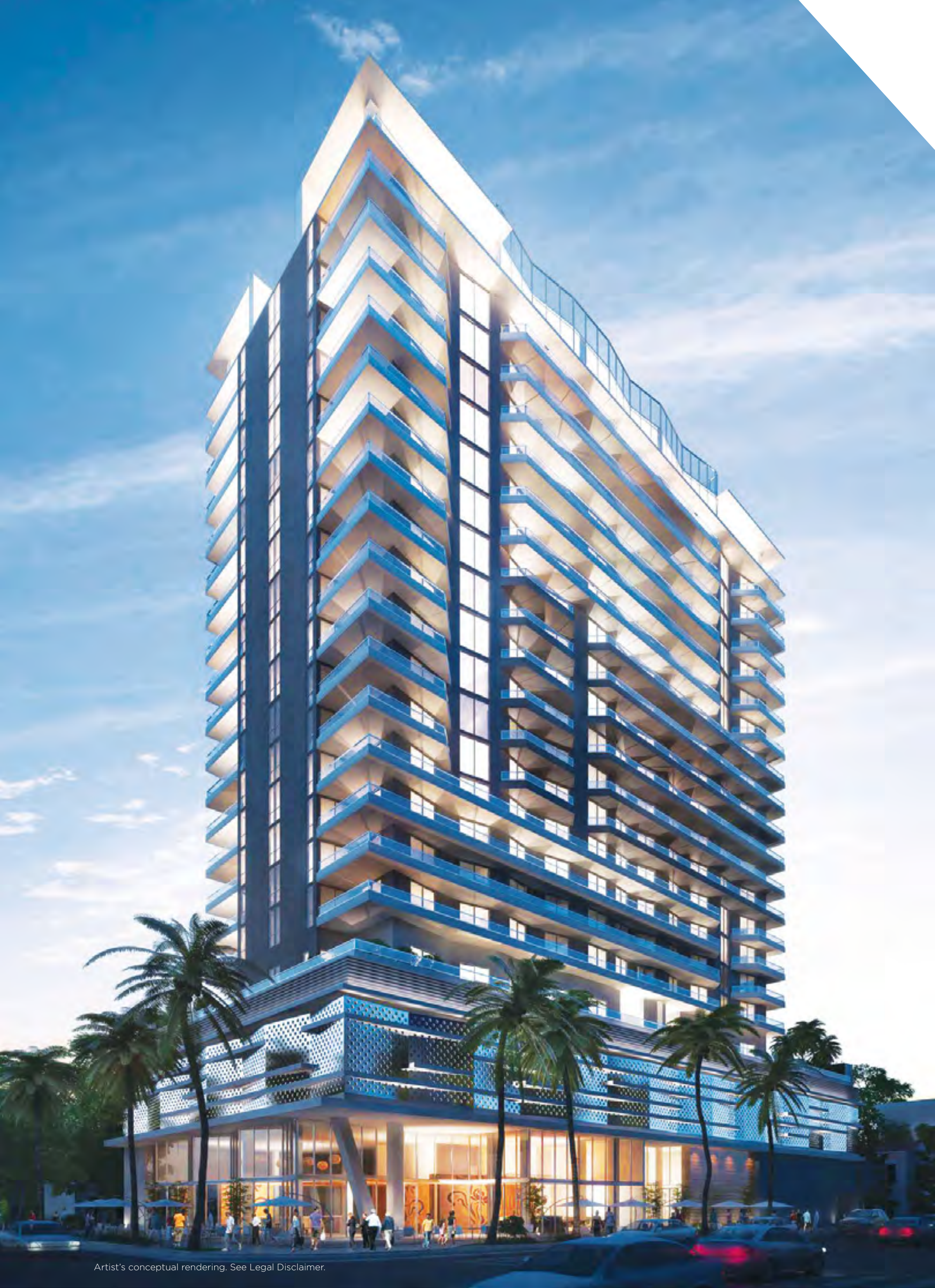
Artist's conceptual rendering. See Legal Disclaimer.