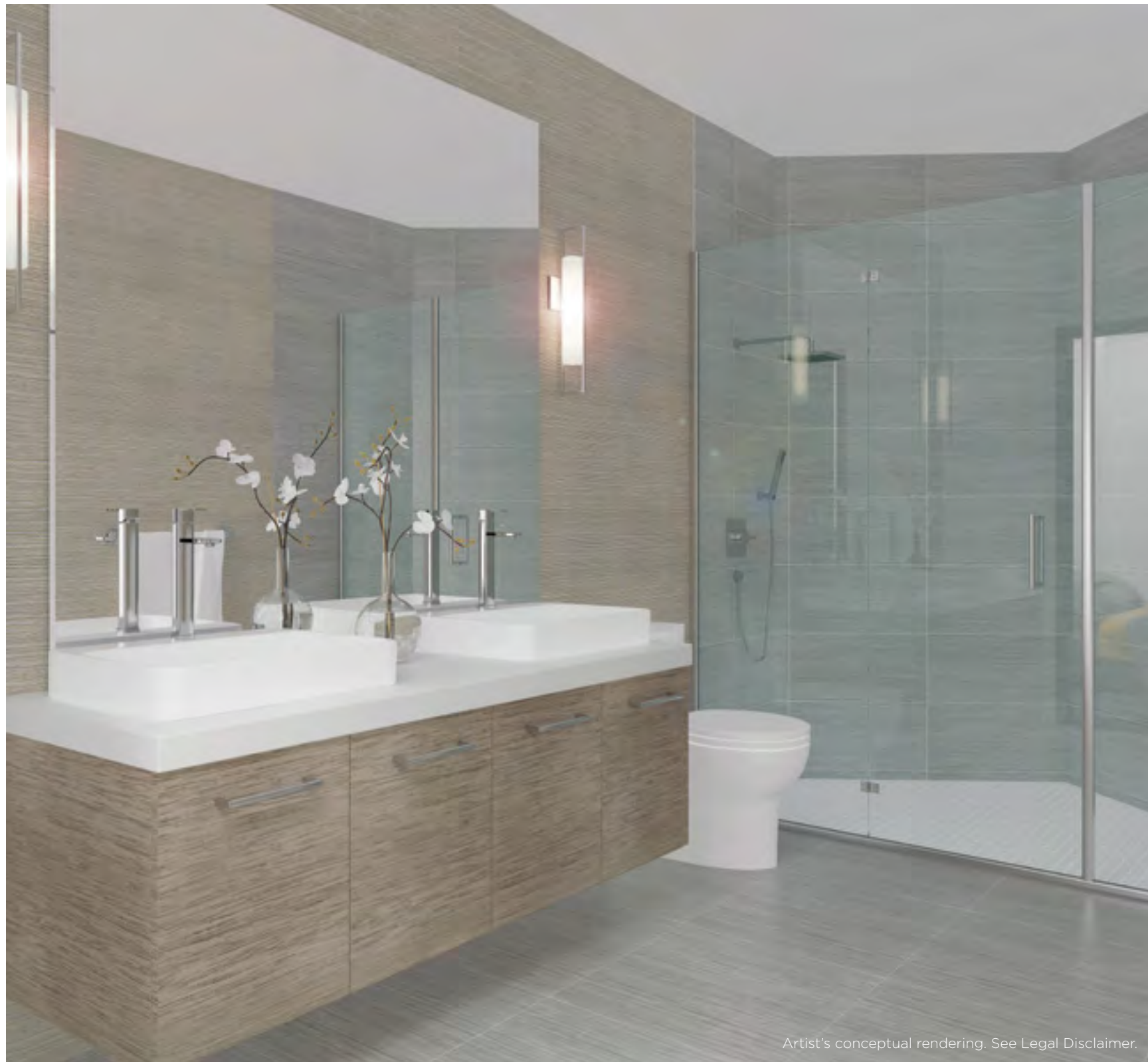
Artist's conceptual rendering. See Legal Disclaimer.