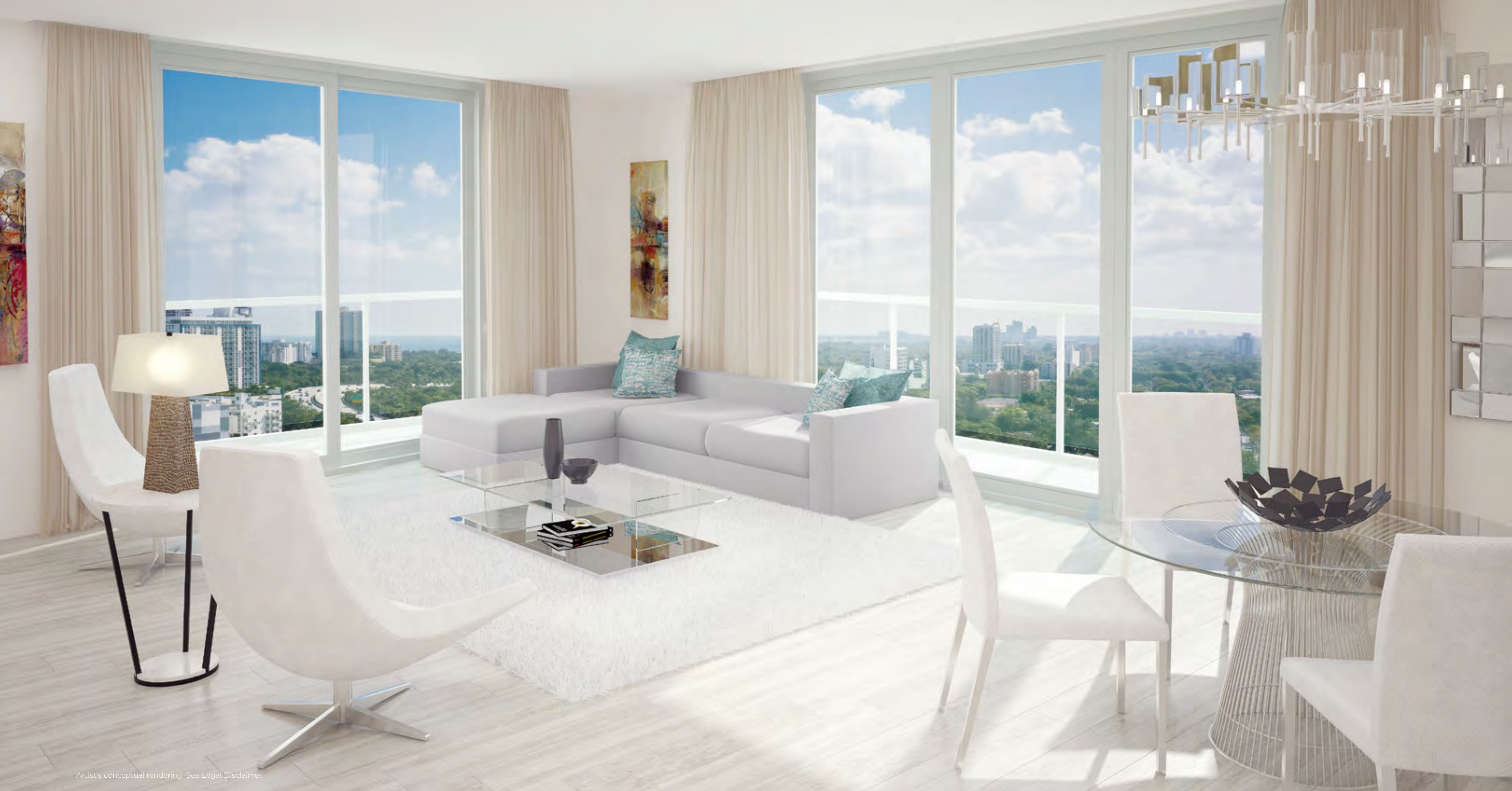
Artist's conceptual rendering. See Legal Disclaimer.