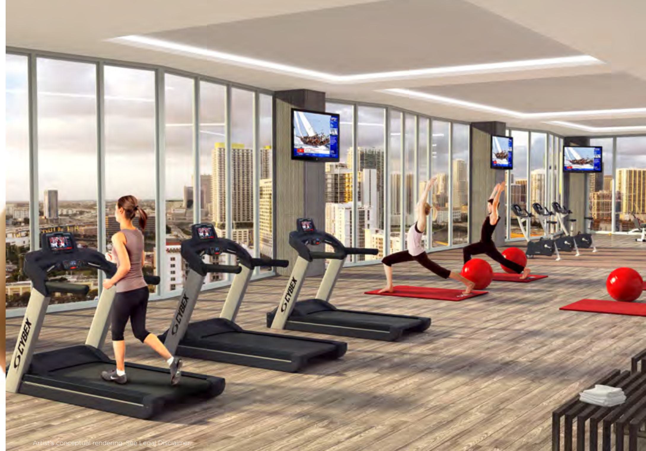
Artist's conceptual rendering. See Legal Disclaimer.

SKYVIEW GYM OVERLOOKING THE MIAMI SKYLINE WITH STATE-OF-THE-ART CARDIO & WEIGHT TRAINING EQUIPMENT