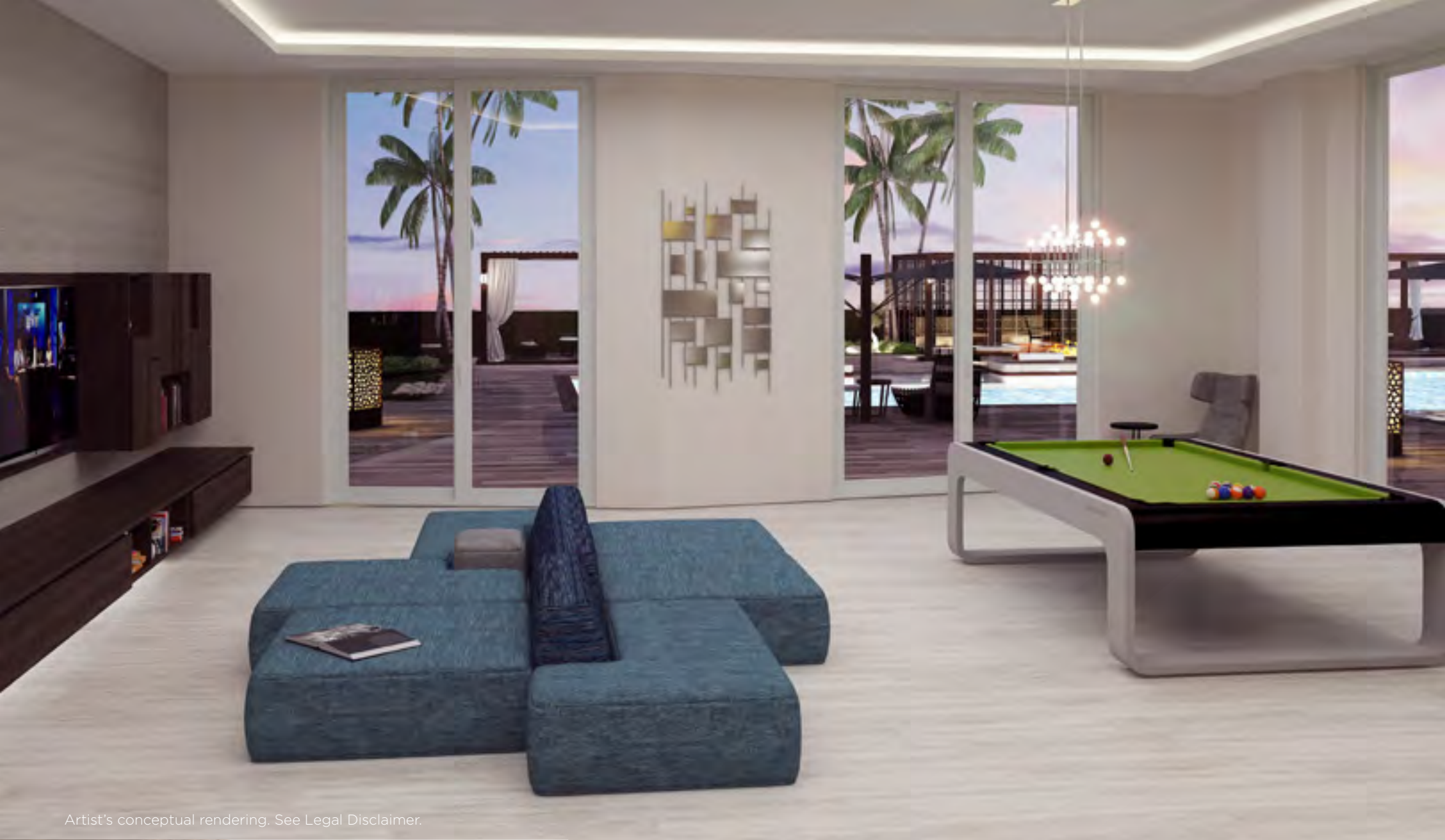
Artist's conceptual rendering. See Legal Disclaimer.