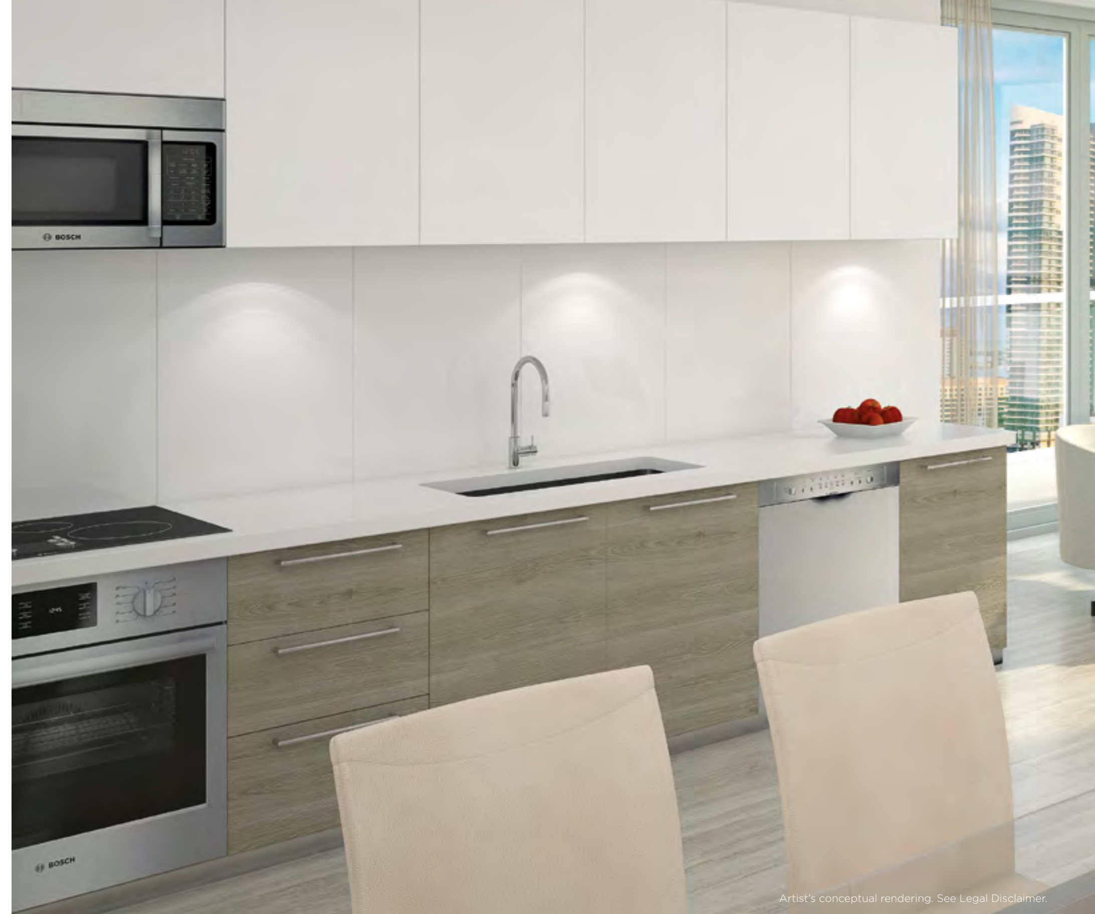
Artist's conceptual rendering. See Legal Disclaimer.