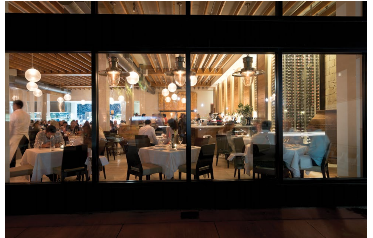
Estiatorio Milos by Costas Spiliadis