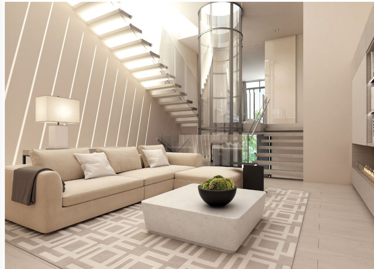
Foyer, First Level

"The uncompromised vision is about creating an experience through which the lifestyle itself is elevated to an art form. Edited color, texture, and form all go beyond the essence of design in pursuit of a comfortable and provocatively luxurious lifestyle." – Charles Allem, Designer