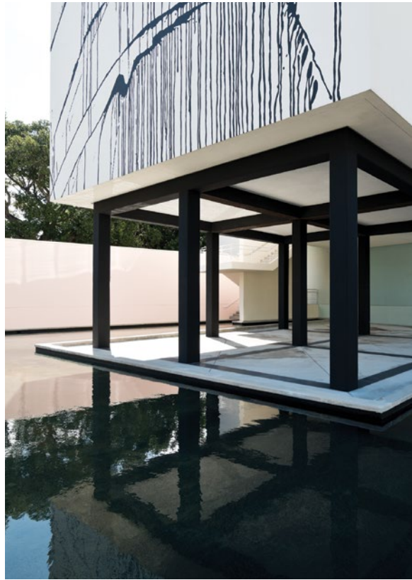
The Bass Museum of Art