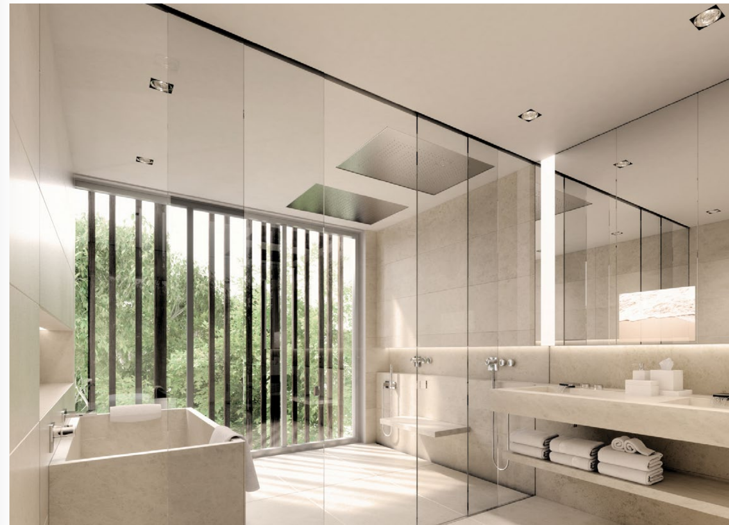
Master Suite, Second Level

Precision-cut Italian tiles effortlessly merge with Pibamarmi marble tub and pedestal vanities, dual rain showers, Dornbracht fixtures and Duravit toilets.