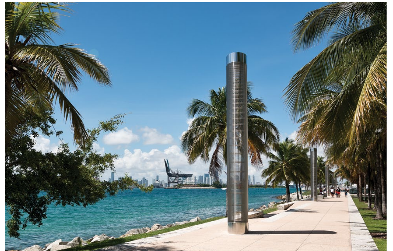
South Pointe Park