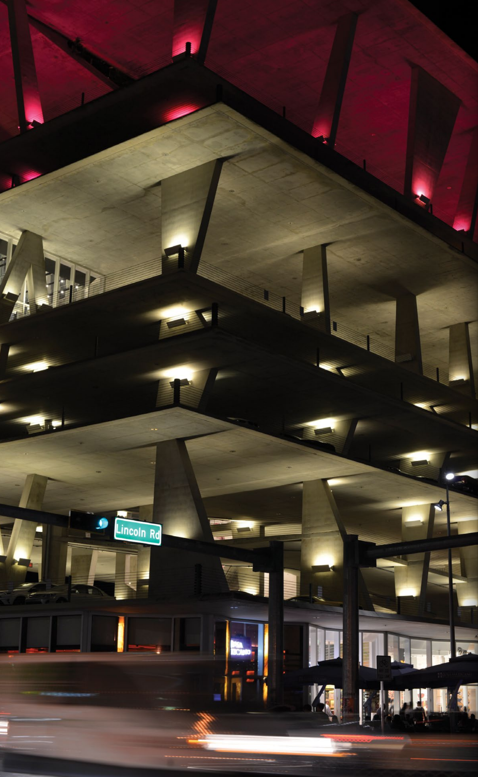
(Previous page) 1111 Lincoln Road