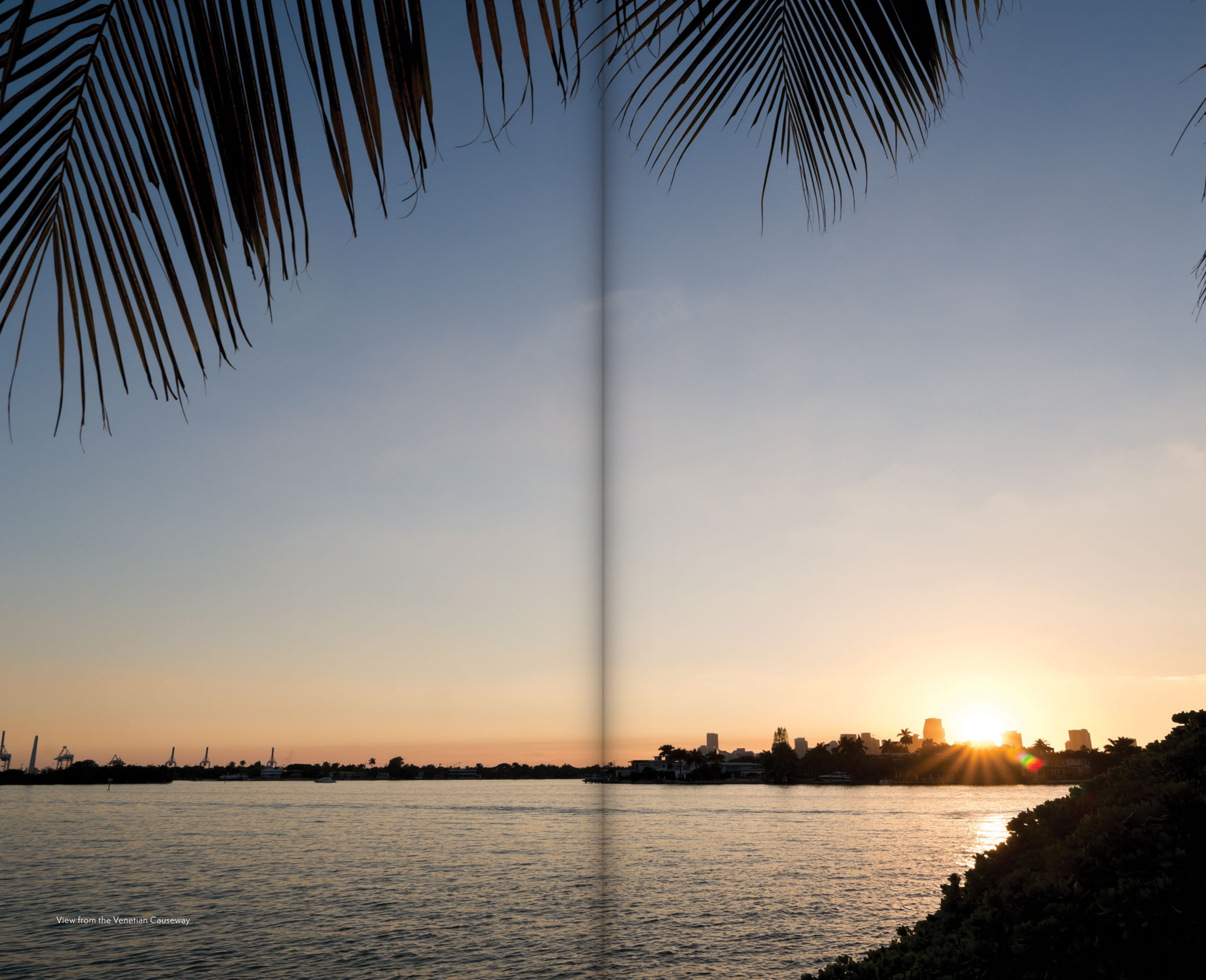
View from the Venetian Causeway