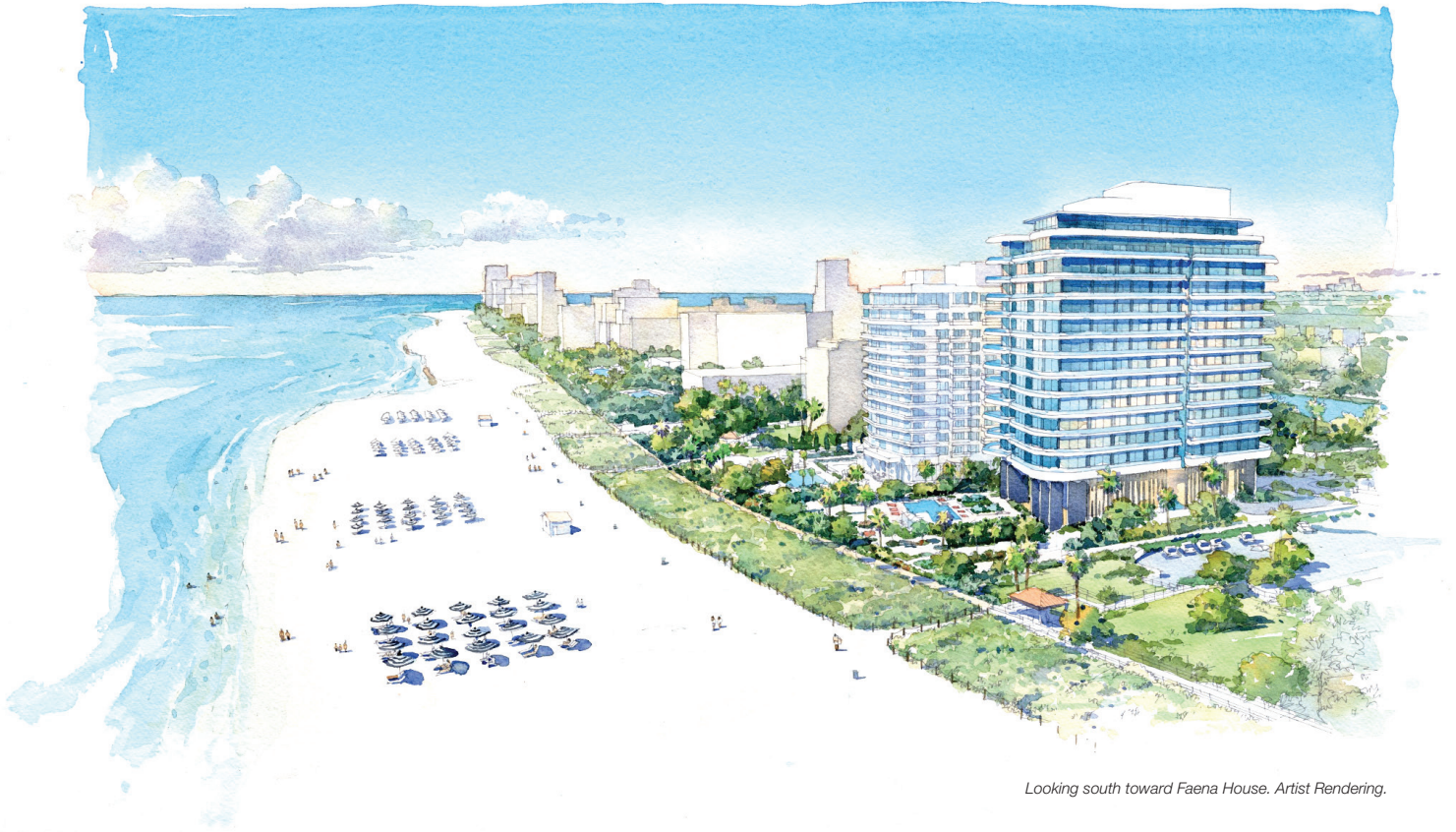
Looking south toward Faena House. Artist Rendering.