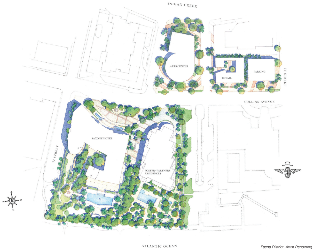
Faena District. Artist Rendering.