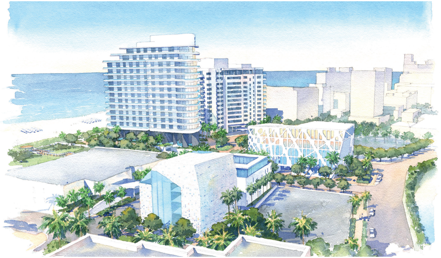
Looking south towards Faena District. Artist Rendering.